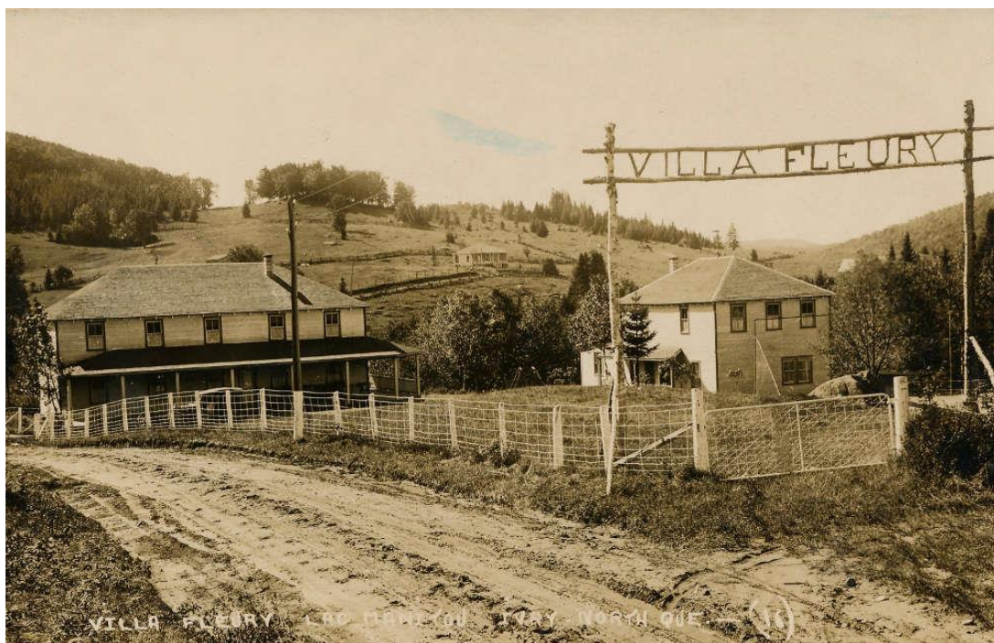
La Villa Fleury, ver 1925 carte postale par Ludger Charpentier, no 16 (Patrimoine-Laurentide)

Villa Fleury had been operated by the Fleury family at least since 1925 when a classified ad in LaPresse read "LAC MANITOU:, Villa Fleury, Ivry, Que, endroit ideal pour vacances. Eau courante, électricité, tennis, danse, etc. Prix modéré."