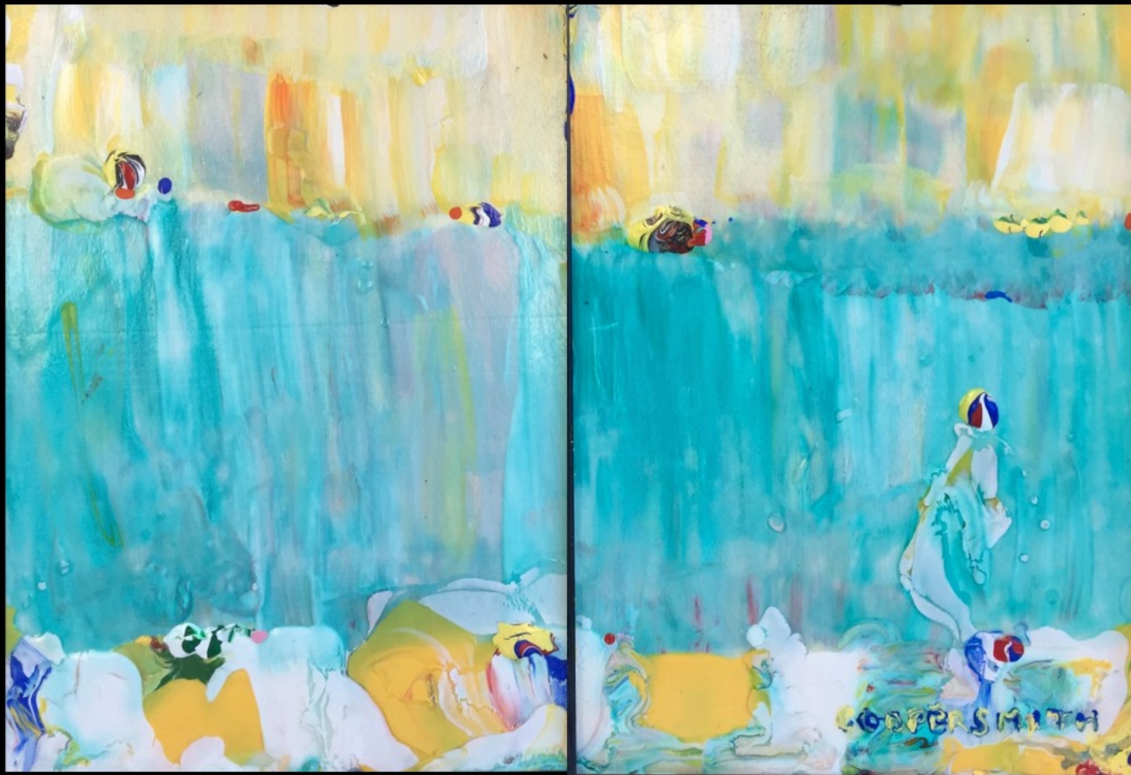
AT THE BEACH

Esthetics has always been an integral focus in my painting and dental careers. I love to make forms and colors dance to your mood's desire and send a message to your soul.